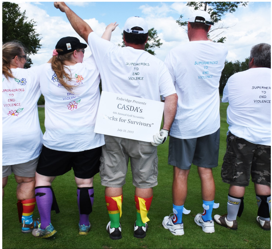
Team Superheroes to End Violence from Four Star Construction

Join our community effort to end violence.