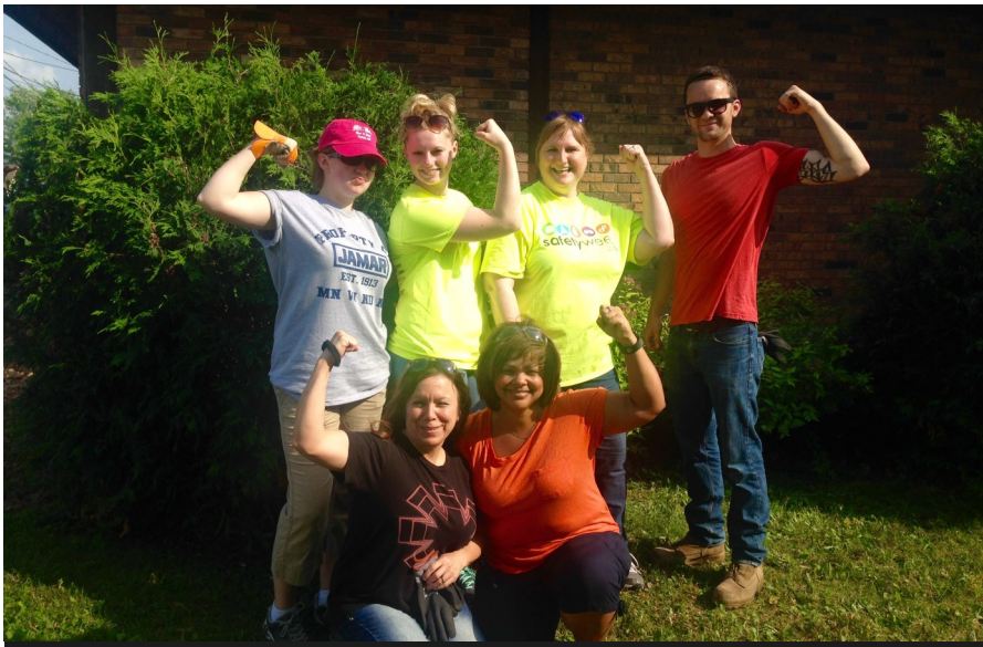
Volunteers from Jamar Company use green thumbs on CASDA's landscaping