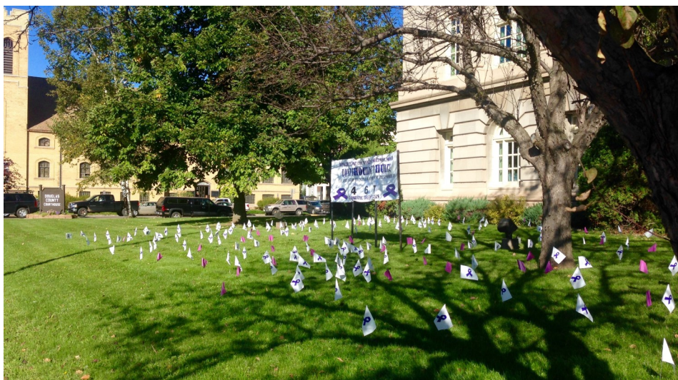
Display at Douglas County Courthouse: in 2014, 467 domestic violence calls in Douglas Cty